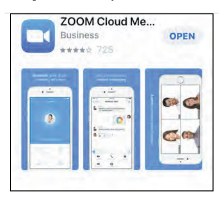
Visit the APP Store